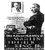
Autobiography of Dr. Martin Luther King

"A CHURCH WITH A MINISTRY THAT REACHES THE WORLD"