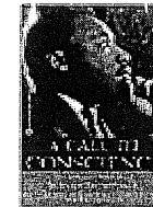
A Call to Conscience