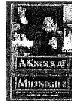
A Knock at Midnight